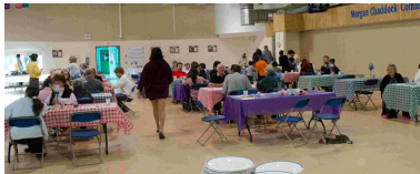
Open House on June 26th